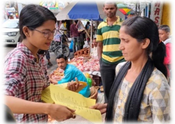
LEAFLET DISTRIBUTION AT CRACKER SELL OUTLETS AND AMONG THE COMMUNITY